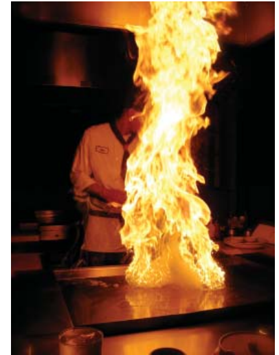
FIGURE 3-4 Open flames used to prepare food and beverages are regulated by the IFC.

Open flames are commonly used in the table side preparation of food and beverages. These activities commonly occur in assembly occupancies such as restaurants and nightclubs; therefore, the use of open flames in an occupancy with a large occupant load requires close supervision and detailed regulations (Figure 3-4). The IFC limits the volume of liquid that can be dispensed to 1 ounce or less per serving and limits the container volume to 1 quart. The activity must have a controlled flame height and is limited to the immediate area where the food is prepared for consumers. Flaming foods and beverages may not be carried through the restaurant or nightclub. The person who prepares the flaming food or beverage is required to have a wet cloth towel to extinguish the flame in the event of an emergency. [Ref. 308.1.8]