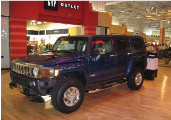
FIGURE 3-8 A vehicle display inside a covered mall building

Vehicle displays inside of buildings must be adequately safeguarded to limit the amount of fuel and ignition sources (Figure 3-8). The IFC requires that such displays limit the amount of fuel to 5 gallons or one-quarter of the tank volume, whichever is smaller, and that the fuel tank fill opening is sealed and the batteries are disconnected. [Ref. 314.4]