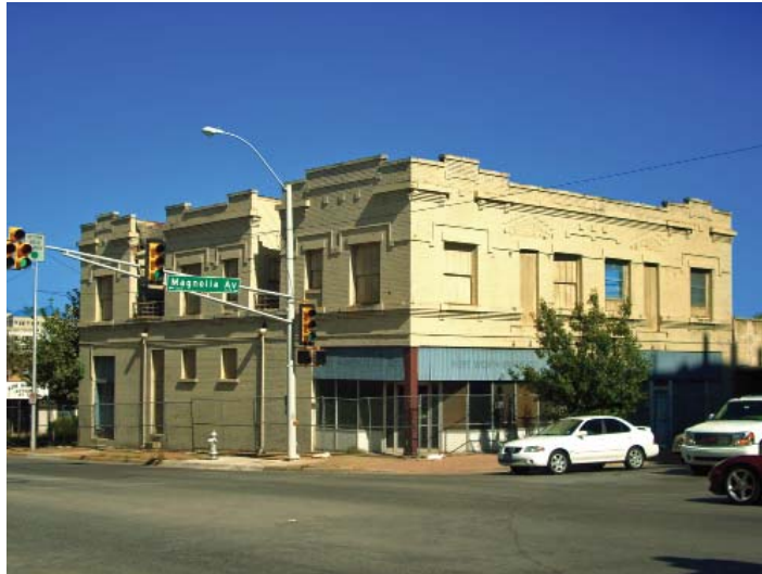
FIGURE 3-6 A safeguarded vacant building

struction and assemblies must be maintained in vacant buildings to limit the spread of fire. [Ref. 311.2]