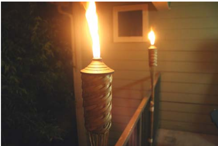
FIGURE 3-3 An open flame decorative device

When open flames are used for decorations, the fuel source cannot be liquefied petroleum gas or a liquid with a flash point temperature less than 140°F (Figure 3-3). If the device contains more than 8 ounces of fuel, it must be designed to be self-extinguishing and have a limited rate of fuel release if it is tipped over. The decorative flame source must be adequately secured and