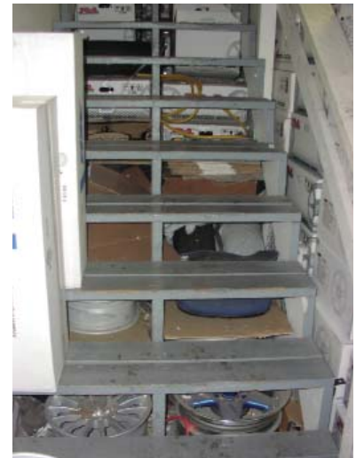
FIGURE 3-1 Ignition of combustible materials beneath the egress stairs can eliminate the stairs as an escape path, and storage of these materials there is therefore a violation of the IFC.

When combustible materials become “waste,” the IFC takes a more aggressive approach: the materials must be removed and disposed of in a controlled manner. For most combustible wastes, the IFC requires that they be placed in noncombustible waste containers or plastic containers formulated from chemicals that reduce the amount of heat it releases if ignited. When materials are placed in bulk trash receptacles (dumpsters), the fire code requires they be located at least 5 feet from combustible construction, wall openings and combustible roof eaves (Figure 3-2). Because of land use limitations, it is very common to place dumpsters inside of buildings. In such instances, the room hous-