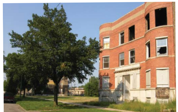
FIGURE 3-5 A vacant building that is not safeguarded

Vacant buildings must be safeguarded to limit the potential for vandalism or acts of arson. The IFC requires that the building's fire protection system be maintained and requires the removal of any combustible materials and hazardous materials. The fire code official is authorized to require placarding of a vacant building to identify fire-fighting hazards. ●