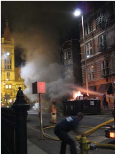
FIGURE 3-2 The IFC requires separation of outdoor dumpsters from buildings to limit the likelihood of the dumpster igniting an exposure building.

ing the dumpster is required to be protected by an automatic sprinkler system. Sprinkler protection is not required when the dumpster is located in a building constructed of noncombustible, fire-resistive materials and used exclusively for dumpster or trash container storage. [Ref. 304.3]