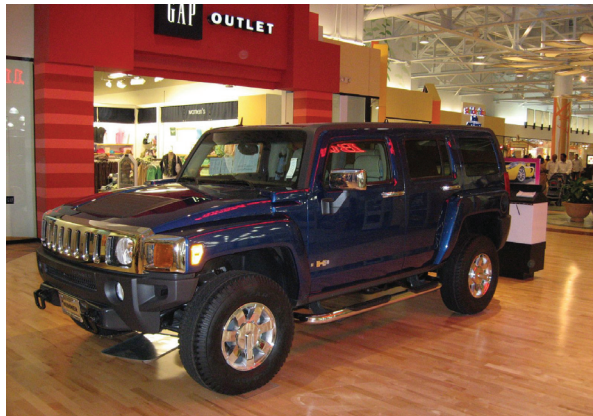
FIGURE 3-8 A vehicle display inside a covered mall building

Vehicle displays inside of buildings must be adequately safeguarded to limit the amount of fuel and ignition sources (see Figure 3-8). The IFC requires that such displays limit the amount of fuel to 5 gallons or one-quarter of the tank volume, whichever is smaller, and that the fuel tank fill opening is sealed and the batteries are disconnected. [Ref. 314.4]