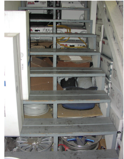
FIGURE 3-1 Storage of combustible materials beneath the egress stairs is a violation of the IFC. The concern is if the materials are ignited, this means of egress component is no longer available for the safe evacuation of the occupants.

When combustible materials become “waste,” the IFC takes a more aggressive approach: the materials must be removed and disposed of in a controlled manner. For most combustible wastes, the IFC requires that they be placed in noncombustible waste containers or plastic containers formulated from chemicals that reduce the amount of heat it releases if ignited. When materials are placed in bulk trash receptacles (dumpsters), the fire code requires they be located at least 5 feet from combustible construction, wall openings and combustible roof eaves (see Figure 3-2). Because of land use limitations, it is very common to place dumpsters inside of buildings. In such instances, the room housing the dumpster is required to be protected by an automatic sprinkler system. Sprinkler protection is not required when the dumpster is located in a building constructed of noncombustible, fire-resistive materials. [Ref. 304.3]