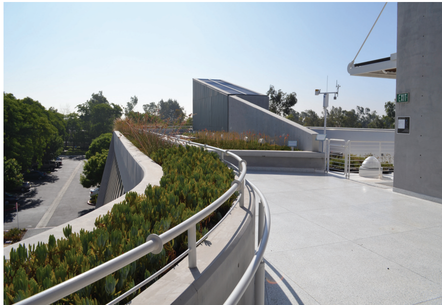
FIGURE 3-10 Landscaping on the roof must be maintained in a safe condition and allow fire-fighting access.

A landscape maintenance plan can be required that would include trimming of trees and shrubs, watering schedule and a list of vegetation species. The plan should provide for the removal of dead and decaying material at least twice a year. [Ref. 317.4]