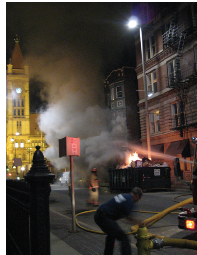
FIGURE 3-2 The IFC requires separation of outdoor dumpsters from buildings to limit the likelihood of the dumpster igniting an exposure building.