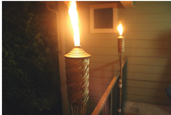
FIGURE 3-3 An open flame decorative device

Open flames are commonly used in the table side preparation of food and beverages. These activities commonly occur in assembly occupancies