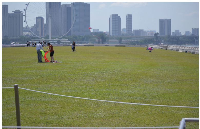
FIGURE 3-9 This grass-covered roof provides a park-like area for recreation.

Planting vegetation on building rooftops is becoming a common occurrence. The vegetation provides several functions. It provides a pleasing area for recreational activities or meetings, as well as a significant level of thermal insulation for the building (see Figure 3-9). The vegetation also creates several concerns for the inspector. Roof ventilation is no longer a viable solution when the roof is covered with several feet of soil, and dying or dead vegetation creates a fire hazard.