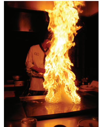
FIGURE 3-4 Open flames used to prepare food and beverages are regulated by the IFC.

Safeguarding a building requires that openings into the structure, such as doors and windows, are protected from unauthorized entry (see Figure 3-6). Whenever possible, fire protection systems should be maintained in service—however, this can be difficult especially in cold weather environments that can freeze water in wet-pipe sprinkler or standpipe