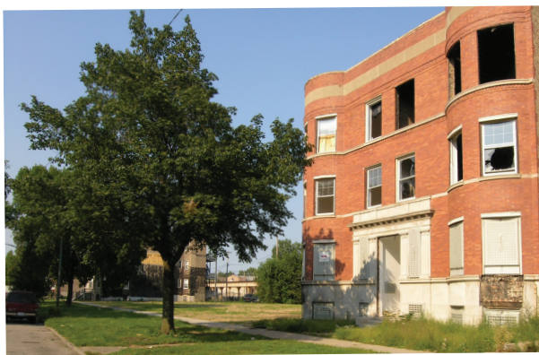
FIGURE 3-5 A vacant building that is not safeguarded. From the exterior, the building is unsafe and should be secured or demolished in accordance with the IFC and International Property Maintenance Code .

Buildings that are vacated can be demolished by the jurisdiction. In many communities the jurisdiction may place a lien on the property to recover the demolition costs. Demolition generally occurs when a building is continuously used for illegal activities, is structurally unsafe or is a fire hazard or a public nuisance. In other cases, the building may be secured and eventually reoccupied or even renovated. In such cases, the securing of the building or its renovation must comply with the IBC, the International Property Maintenance Code , and the IFC (see Figure 3-5). [Ref. 311.1.1]