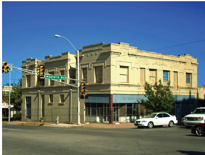
FIGURE 3-6 A safeguarded vacant building