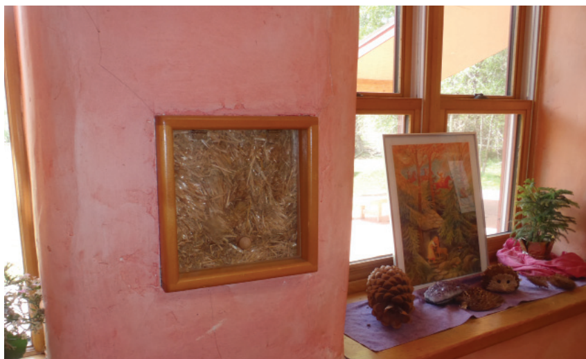
FIGURE 3-7 Straw bale insulation

Although the IECC lists the most commonly used and standard methods, it is not meant to limit the use of alternative approaches, equipment, or techniques that also conserve energy. If a mechanical, plumbing or electrical system; insulation material; or building envelope technique is not specifically listed as allowed in the code or does not meet the strict letter of the code, it may nonetheless be allowed by the building official, as energy-conserving innovations are encouraged. For example, Figure 3-7 illustrates the use of straw bale as insulation, and Figure 3-8 shows straw bale used as a building material for a school. [Ref. C101.3]