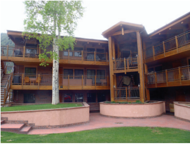
FIGURE 3-2 A three-story apartment building is not regulated by the commercial energy provisions.