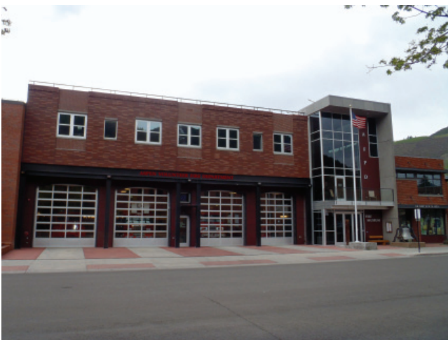
FIGURE 3-5 Fire station

offices, banks, clothing stores, restaurants, bars, retail sales, automobile repair shops and gyms. The IBC occupancy groups are Assembly, Business, Educational, Factory, High-hazard, Institutional, Mercantile, Residential, Storage, and Utility and Miscellaneous. A four-story hotel (Figure 3-3), tall office building (Figure 3-4), fire station (Figure 3-5) and corner store (Figure 3-6) are all regulated by the commercial energy code provisions. [Ref. C101.5]