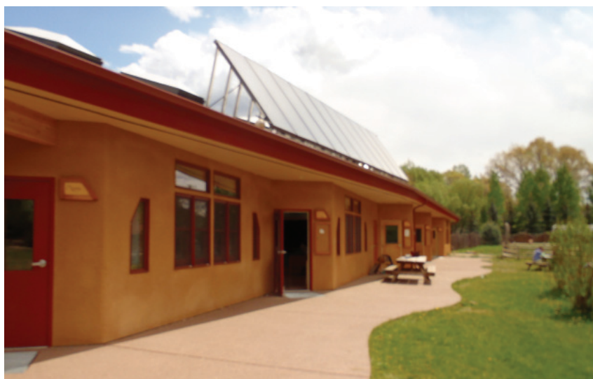
FIGURE 3-8 Straw bale as a building material