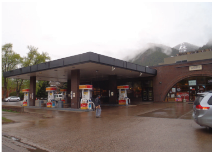
FIGURE 3-6 Corner store