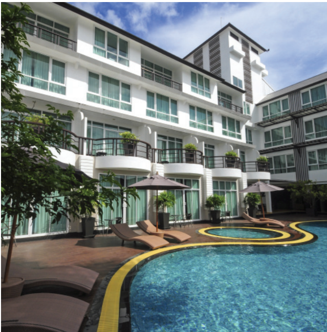
FIGURE 3-3 Four-story hotel