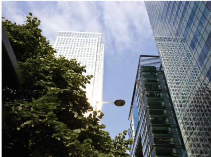
FIGURE 3-4 Office building

offices, banks, clothing stores, restaurants, bars, retail sales, automobile repair shops and gyms. The IBC occupancy groups are Assembly, Business, Educational, Factory, High-hazard, Institutional, Mercantile, Residential, Storage, and Utility and Miscellaneous. A four-story hotel (Figure 3-3), tall office building (Figure 3-4), fire station (Figure 3-5) and corner store (Figure 3-6) are all regulated by the commercial energy code provisions. [Ref. C101.5]