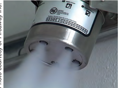
Electrically-operated aerosol fire-extinguishing device